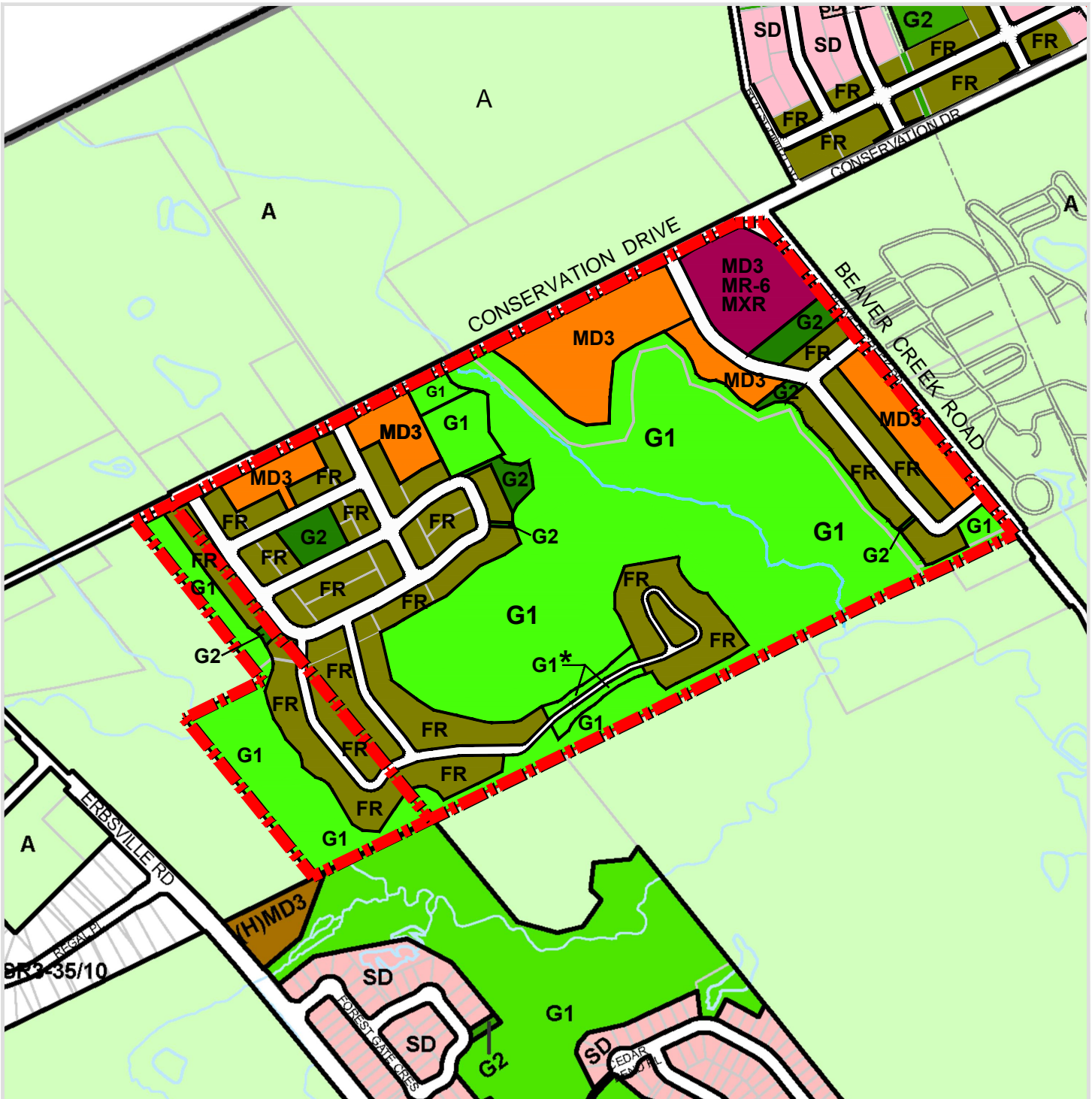
Figure 7 City of Waterloo, Proposed Zoning

Northgate Land Corporation & Erbsville Kartway City of Waterloo, Region of Waterloo